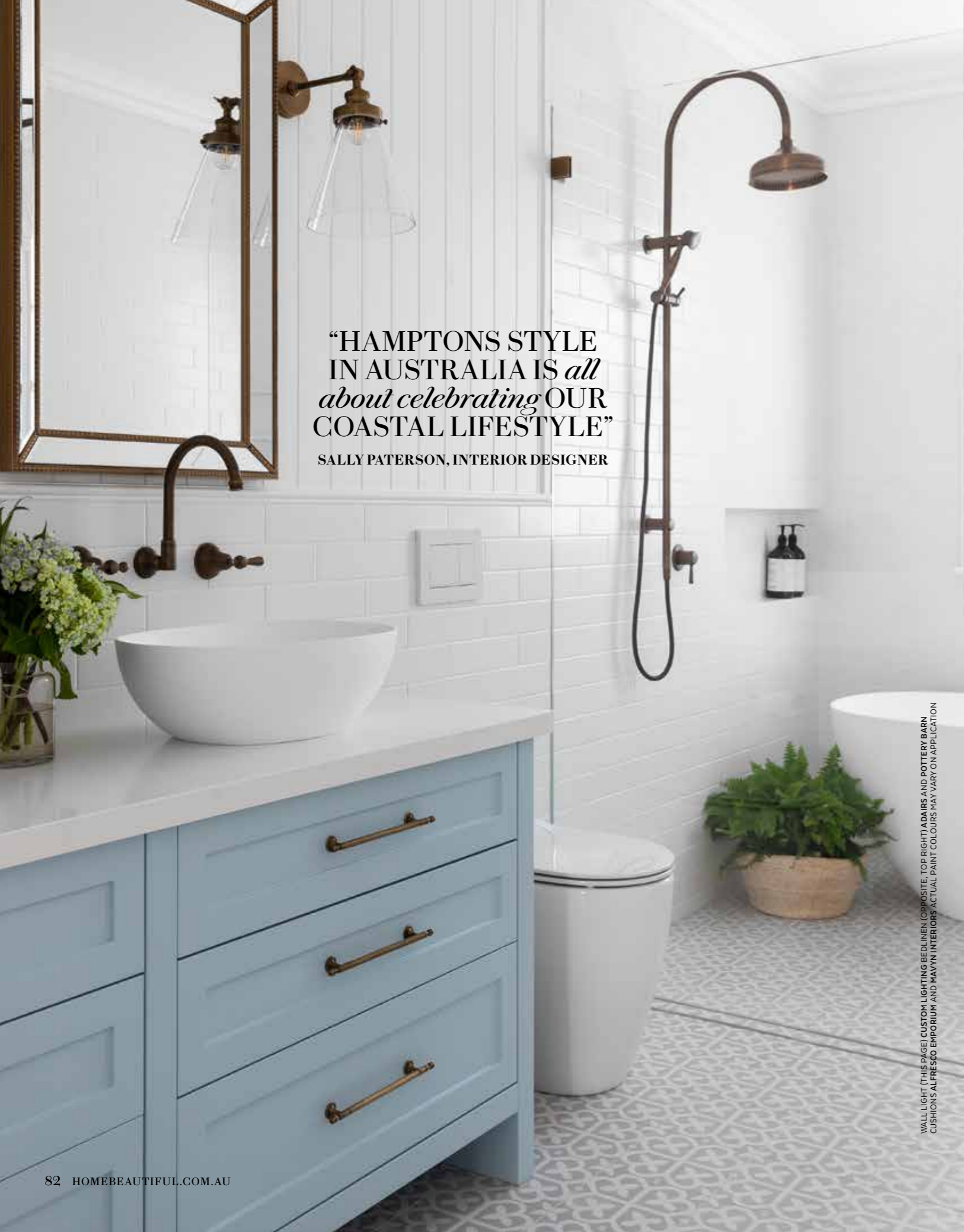
WALL LIGHT (THIS PAGE), CUSTOM LIGHTING BEDLINE (OPPOSITE), TOP RIGHT), ADAIRS AND POTTERY BARN CUSHIONS ALFRESCO EMPORIUM AND MAVYN INTERIORS. ACTUAL PAINT COLOURS MAY VARY ON APPLICATION