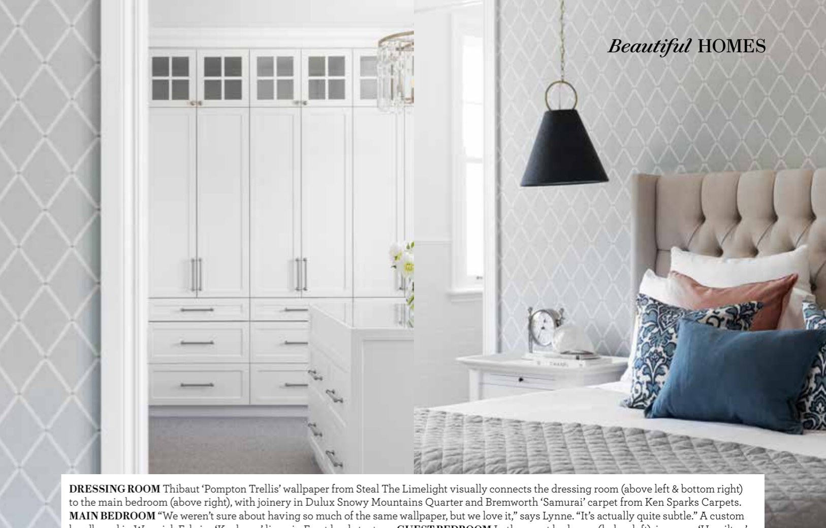
DRESSING ROOM Thibaut 'Pompton Trellis' wallpaper from Steal The Limelight visually connects the dressing room (above left & bottom right) to the main bedroom (above right), with joinery in Dulux Snowy Mountains Quarter and Bremworth 'Samurai' carpet from Ken Sparks Carpets. MAIN BEDROOM "We weren't sure about having so much of the same wallpaper, but we love it," says Lynne. "It's actually quite subtle." A custom headboard in Warwick Fabrics 'Keylargo' linen in Frost lends texture. GUEST BEDROOM In the guest bedroom (below left), is a cane 'Hamilton' bedhead from Abide Interiors, a 'Sorrento' bedside table from Living Styles and 'White Coral' wallpaper from Olive et Oriel. BATHROOM 'Hardie Groove' VJ lining boards and joinery in Dulux Sea Breeze Half add a coastal feel to the bathroom (opposite) while a 'Zeta' mirror from Café Lighting & Living sits above Faucet Strommen 'Cascade' tapware from Bathroom Collective. The Kado 'Lussi' basin is from Reece. >