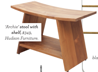
'Archie' stool with shelf, $349, Hudson Furniture.