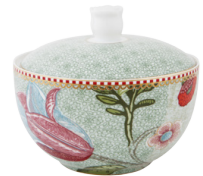
Pip Studio 'Spring To Life' cotton box in Celadon, $35, Amara.