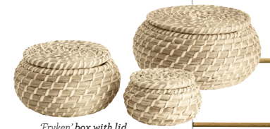
'Fryken' box with lid, set of 3, $17.99, Ikea.