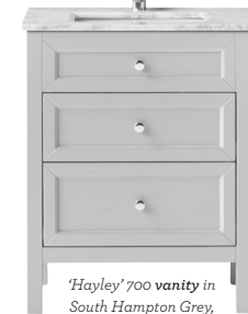
'Hayley' 700 vanity in South Hampton Grey, $1800, Vanity by Design.